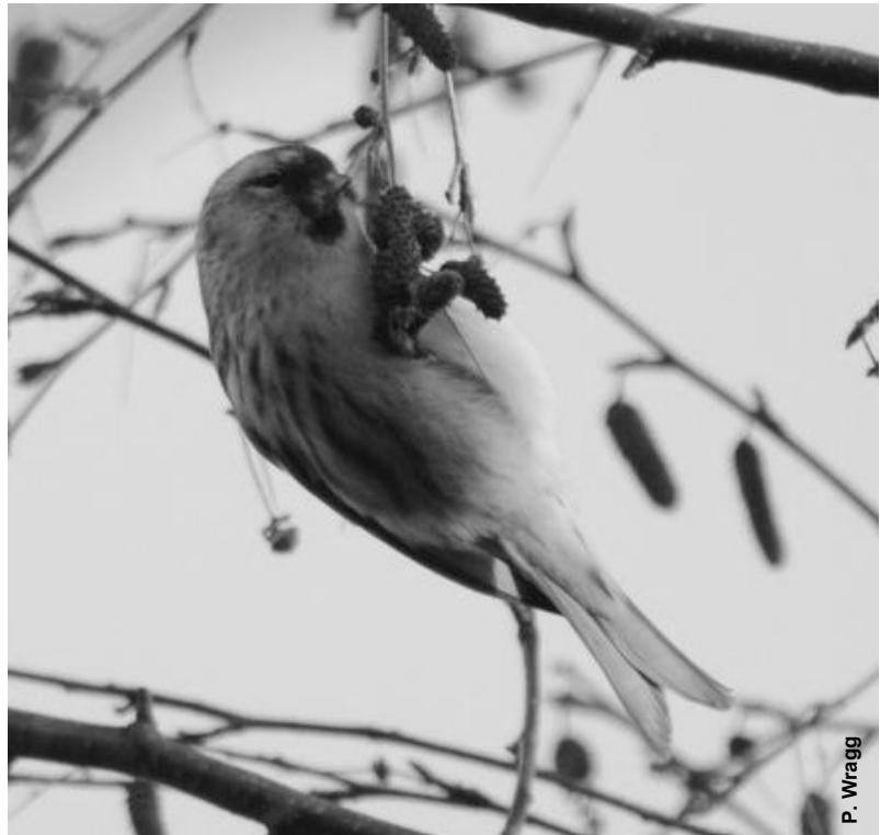
This Mealy Redpoll was one of ten at Ulley CP in late January, a group which helped make a memorable month for this species.

Linnet - 100 were at Pebley on 3rd Jan, and 60 at Ulley on 14th.