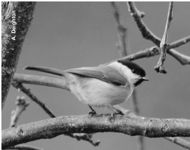
This Marsh Tit was at Monsal Dale on 8th January.

with ones and twos seen on several dates in Jan, and one flew down the River Don at Attercliffe on 26th.